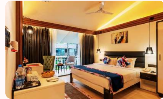
Premium Room with garden view

Quaint and homey with comfortable furnishings and a private balcony for a beautiful view of the gardens.