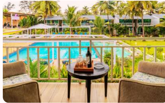
Premium Room with Pool view

Spacious and elegantly decorated with all the modern amenities for a comfortable stay.