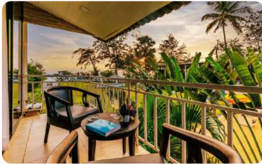
Premium Room with sea view

Whether you're a solo traveler, couple or family, Foxoso La Beach Resort has something for everyone. From luxurious suites to cozy cottages, our accommodations provide comfort, convenience, and a relaxing ambiance. You can also enjoy stunning views of the ocean from your room.